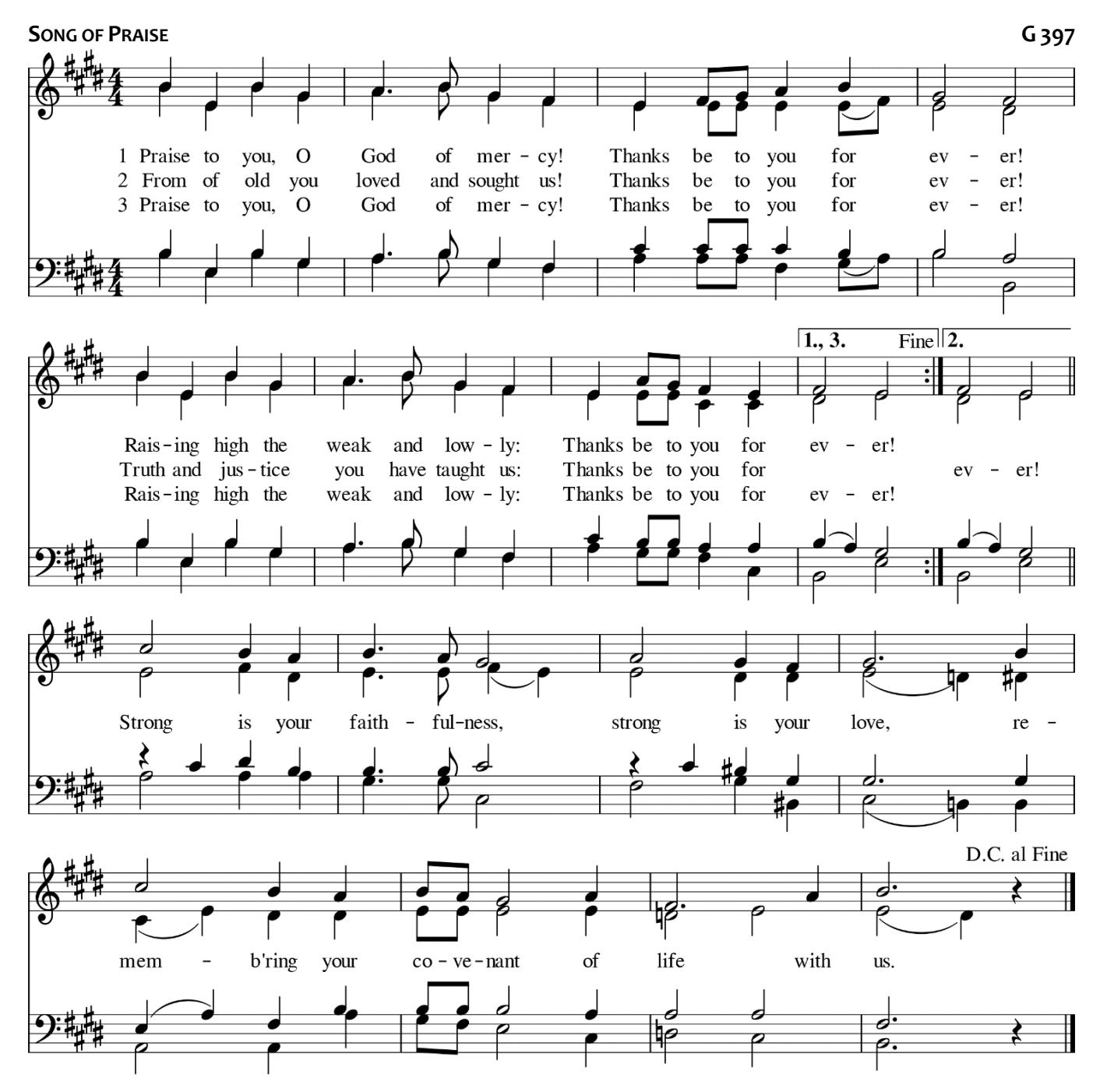
Words & music: Marty Haugen (b. 1950); © 1990, GIA Publications, Inc. Reprinted with permission under ONE LICENSE #A-719358. All rights reserved.