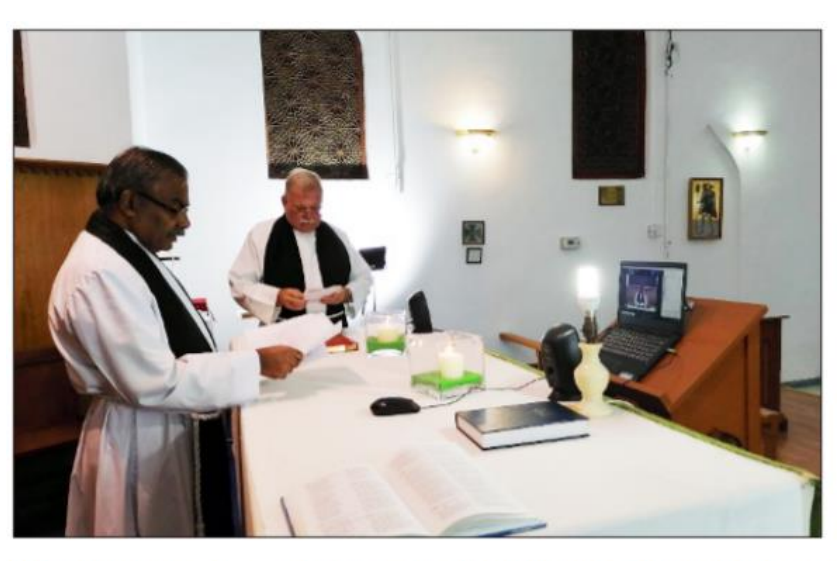
Worship during the pandemic at St. Christopher's Cathedral, Bahrain. Note the laptop on the lectern.

In the Middle East, the political instability of countries like Lebanon, Syria, Iraq, and Yemen can overshadow all other concerns. Governments in turmoil con-