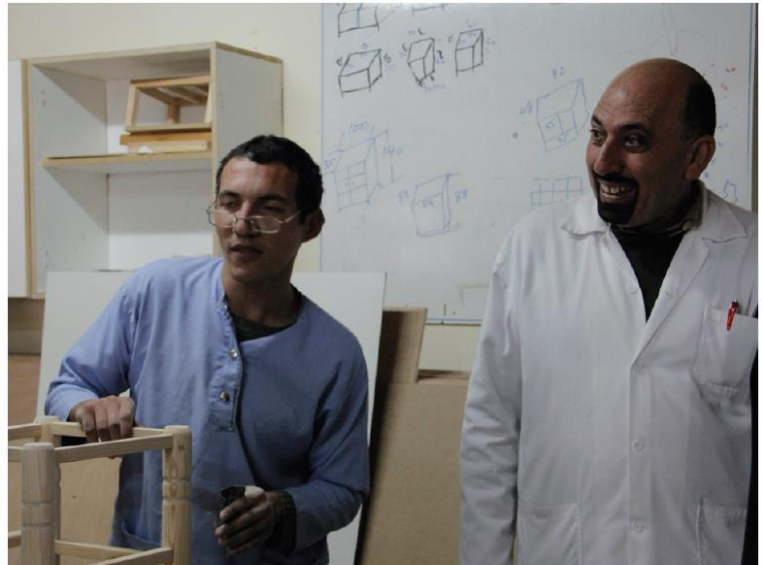
“Sheltered Workshop” program at Princess Basma Center, Jerusalem.

In the year 46 CE, a famine descended upon Jerusalem. When St. Paul learned of this, he decided to raise funds among the churches he had established in Galatia and Greece to bring relief to the ‘saints’ in Jerusalem. Christianity was in its infancy, and significant debate was under way about how Jewish a believer had to be to be a follower of Jesus. St. James, leader of the church in Jerusalem, and St. Paul, apostle to the Gentiles (as he came to be known) struggled with how to resolve this tension. Paul’s letters and the Book of Acts are full of the details of this identity crisis.