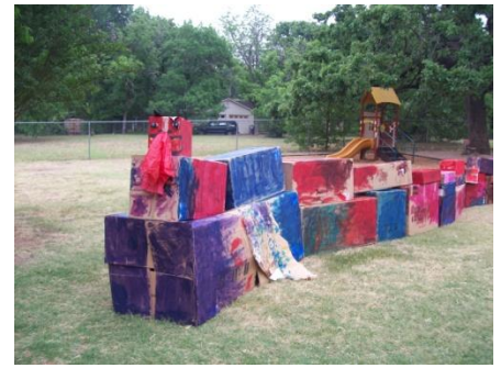
The fierce dragon...

their very own shield and helmet! On Thursday morning, April 21 st , the brave knights of St. George's defeated the fierce cardboard dragon in our yearly re-enactment of the story. It was such an exciting morning of anticipation followed by a fierce battle in which our young knights emerged victorious, as they do every year. Many parents and grandparents enjoyed coffee and doughnuts in Kleberg and watched all of the action.