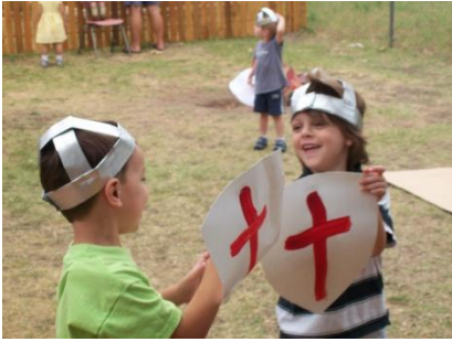
Our brave knights!

April was filled with studies and celebrations of St. George! The children spent weeks reading the story of St. George and the dragon and used this opportunity to talk about topics such as real and pretend and play fighting vs. real fighting. They also got to make