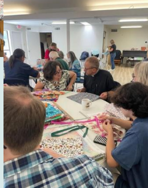
The blessing of the bags for SAFE was beautiful and meaningful, and 200 handmade bags filled with over a dozen comfort items each, are