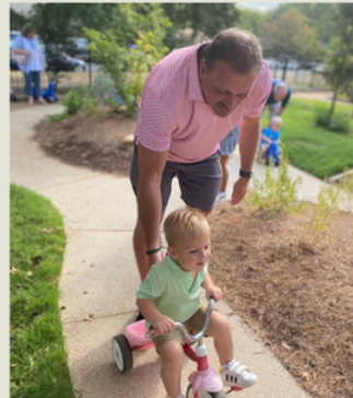
Grandparent's Day @ St. G's